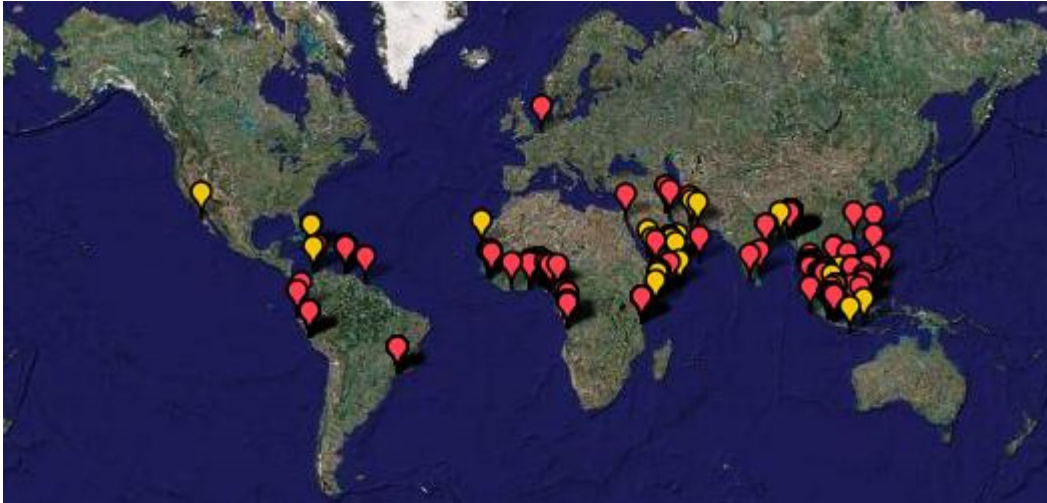
Fig. 4. the map of modern piracy (IMB Live Piracy Map 2007)

were killed during 325 attacks of piracy, which was believed as the bloodiest year in of modern piracy. Among those victims, half of them were murdered in waters off Nigeria. The first and second quarter Piracy Reports in 2005 showed that more than half of pirate attacks (51%) occurred in Southeast Asian waters near the Malacca Straits (Fig. 4); attacks in East African coastal water was in 2 nd place (20%). Other piracy victims were claimed in America, Far East, and India, according to the IMB's statistics records. 6