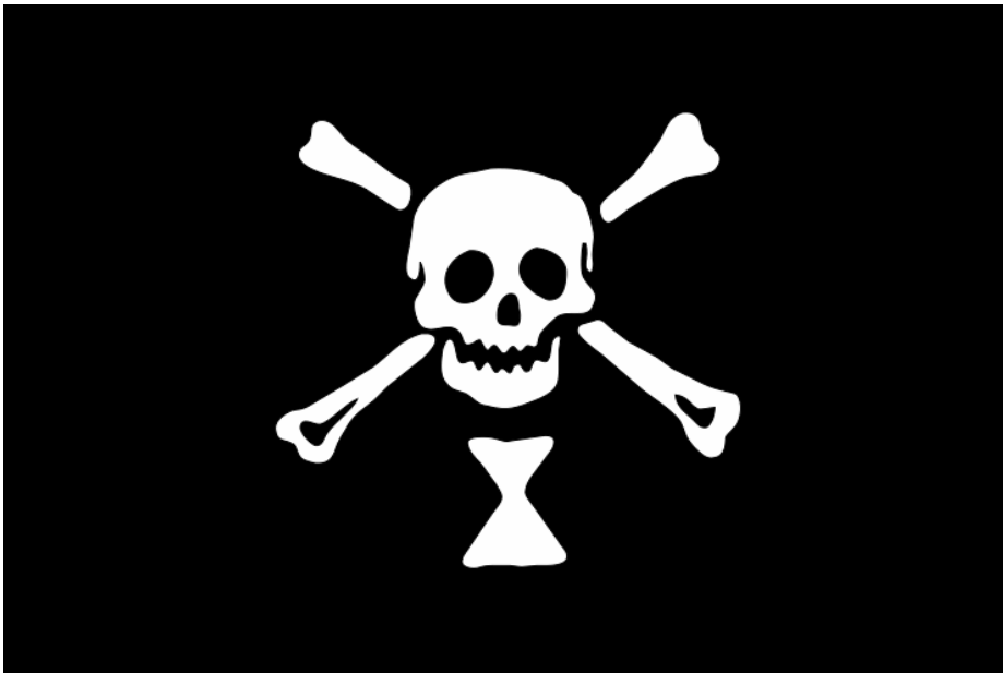
Fig. 3. The flag pattern of the skull and crossbones with an hourglass on the French pirate Emanuel Wynne's ship.

French. 5 The flags were symbols of inhumanity of pirates. And they meant to strike mortal terror of the pirate's intended victims. The patterns on the flags were commonly appeared with skeletons, daggers, cutlasses, or bleeding hearts. These features were patterned on white, red, or black fields. The first appear of the skull and crossbones motif was approximately in 1700, when a French pirate named Emanuel Wynne hoisted his fearful ensign in the Caribbean. An embellishing hourglass was placed under the skull and crossbones, indicating victims that they were running out of time. The different base colors of the flags have different meanings. Generally, a white flag was flying when pirates were in chase of a potential victim. In some cases, the victim would strike back since their ship might also be armed to have self-defense capability, the black and white flag was raised to indicate that the pirates were ready to fire and seeking chance to board on the victim ship.