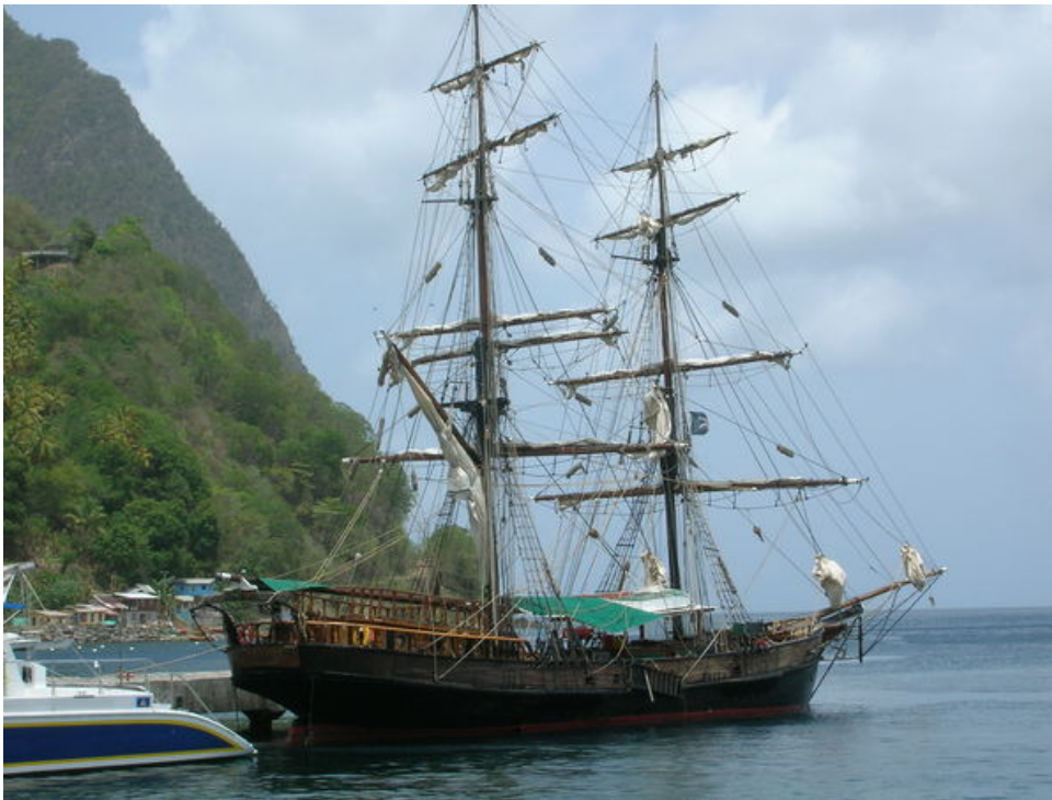
Fig. 2. A preserved pirate ship at Soufriere, St. Lucia