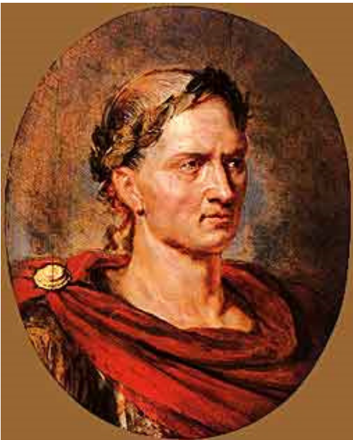
Fig. 1. The painting of Julius Caesar. He was known as the first person (or governor) to fight against pirates.

Piracy has been a problem since maritime commerce started. There were records of piracy in Ancient Greek history. Piracy had not been a significant problem in maritime commerce until Rome took the power of the Mediterranean. The famous story of the earliest piracy victim was Julius Caesar, in 75 B.C. He was held for a large amount of ransom, but those pirates responsible were arrested and, reportedly, crucified. Julius Caesar was known as the first person to fight against pirates. 1 During that era, the pirates were better organized than the empire navy. Until 10 A.D, Rome's naval power had the capability to fight against pirates. 2